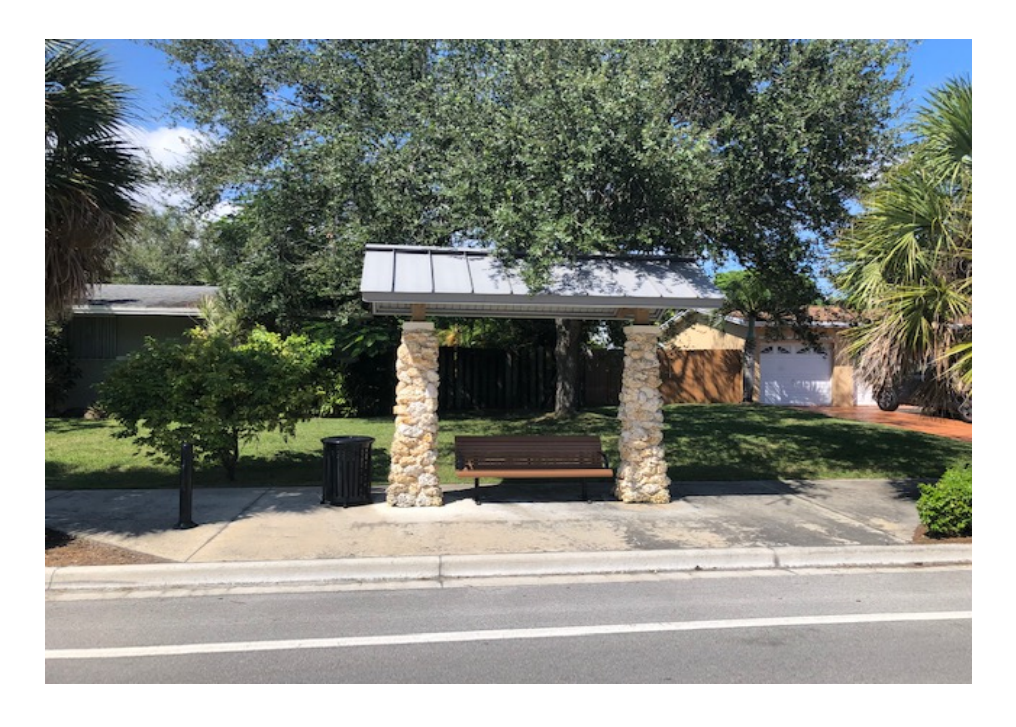
Decorative Bus Shelter: Caribbean Boulevard West of SW 87