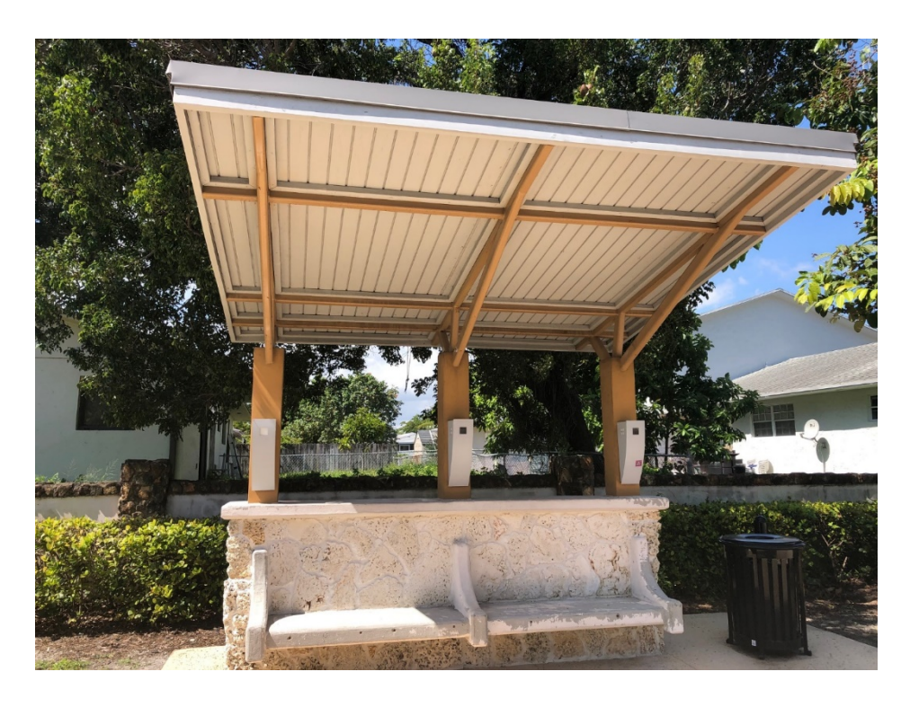
Decorative Bus Shelter: Old Cutler Road North of SW 92 Avenue