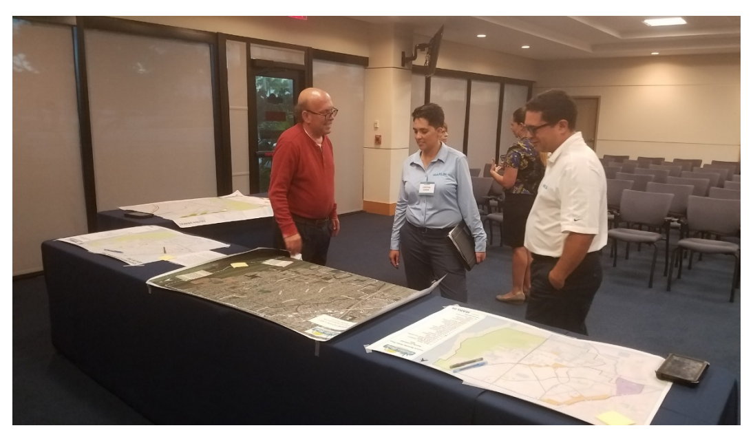
First Public Involvement Workshop Cutler Bay Town Hall April 30, 2019

Town of Cutler Bay and Miami-Dade County Department of Transportation staff participated in Public Involvement Workshops at local center for seniors and Town Hall to discuss future Mobility Hubs Plan.