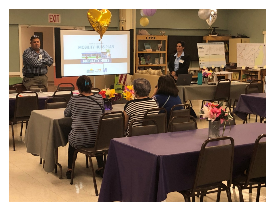
Second Public Involvement Workshop Pine Woods Villa September 23, 2019