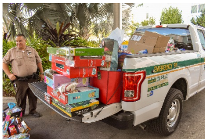
East Ridge Retirement Village Toy Collection