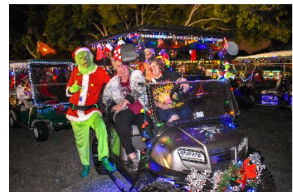
8 th Annual Holiday Golf Cart Parade, Toy Drive & Winter Celebration