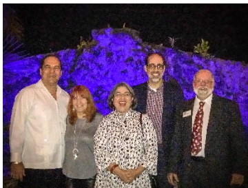
Cutler Bay Business Association Holiday Party

Note: For additional information regarding upcoming meetings, workshops, and/or special events, please visit our website at www.cutlerbay-fl.gov