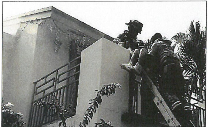
MDFR's Engine 9 crew rescues elderly woman from a house fire

Through the efforts of MDFR, Miami-Dade residents also have the highest survival rates in the nation, after suffering a blocked coronary artery. Over ten years ago, MDFR established the Miami-Dade STEMI (ST-Elevation Myocardial Infarction) Network. STEMI typically refers to a blocked coronary artery and is the leading cause of death in the United States for both men and women. Hospitals within the STEMI network are required to restore blood flow to a patient's blocked artery within 90 minutes from the initial patient contact. This timely intervention significantly reduces a patient's chances for permanent damage or death and increases their likelihood for survival. The STEMI network has reduced the time it takes to restore blood flow to a patient from approximately two hours and 15 minutes to 60 minutes.