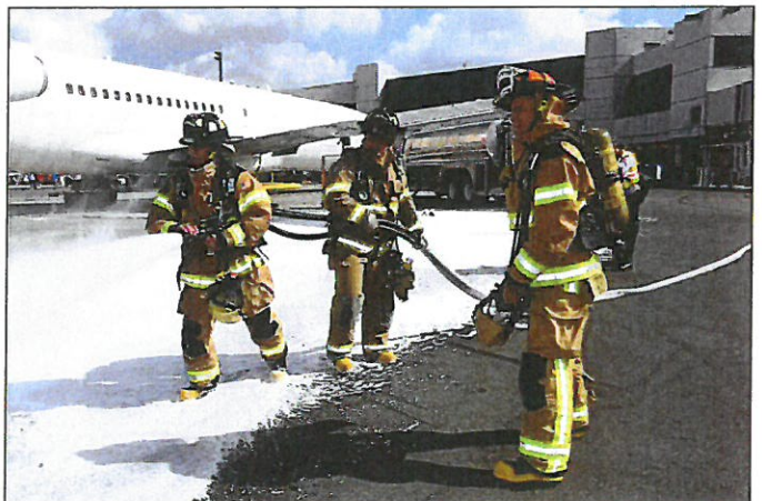
MDRF firefighters at Miami International Airport

MDRF has 55 frontline rescue units, each staffed by three (3) State of Florida certified paramedics. MDRF offers patient transportation options. Patients with life-threatening emergencies will be transported to the closest appropriate medical facility within Miami-Dade or Broward County. MDRF will transport patients without life-threatening emergencies to the medical facility of their choice. MDRF also has EMS Captains who act as patient advocates in ensuring the timely transfer of patients to Miami-Dade and Broward County medical facilities.