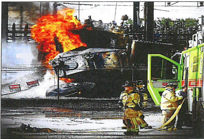
Firefighters battle a fire at an FPL electrical facility

Miami-Dade Fire Rescue (MDFR) originated as a single-unit fire patrol in 1935. It has since grown into the largest fire rescue department in the Southeast United States and one of the top ten largest in the nation. With a response territory of 1,899 square miles and a resident population of more than 1.9 million, MDFR responds to more than 260,000 calls for assistance annually making it one of the busiest departments in the nation. More than 2,400 employees staff 143 units in service throughout 69 fire rescue stations and several administrative facilities serving residents, businesses, and visitors 24 hours a day, 7 days a week, 365 days a year. In addition to providing transport services through 55 advanced life support (ALS) rescue units, MDFR provides emergency air transport service to appropriate specialized facilities via two full-time rescue helicopters.