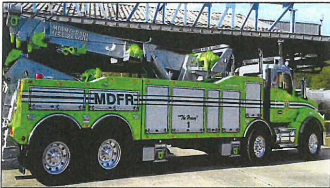
MDFR's "The Heavy" 1 Class D Wrecker

MDFR's Special Operations Division received a new specialty unit in July 2017. The "The Heavy 1" Class D wrecker was the result of a collaborative project between MDFR and truck manufacturer Jerr-Dan. This unit will enhance our rescue capabilities on complex extrications and emergencies such as motor vehicle accidents involving heavy trucks, train accidents, aircraft crashes, and large animal rescues throughout Miami-Dade County.