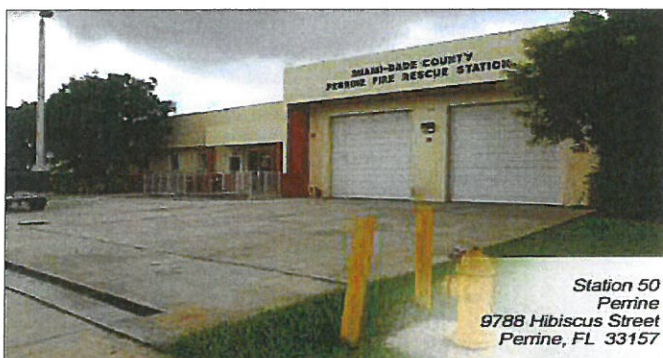
Station 50 Perrine 9788 Hibiscus Street Perrine, FL 33157

Based on structure and unit information provided by the Miami-Dade County Property Appraiser, the Town of Cutler Bay has 10,945 single-family and duplex units, 4,037 multi-family and condo units, and 262 commercial, industrial, and other structures. The majority of the commercial, industrial, and other units would require a high-hazard response to a structure fire incident in the Town. As a result, on an initial dispatch to a structure fire, 24 firefighters and two (2) command chiefs would be required.