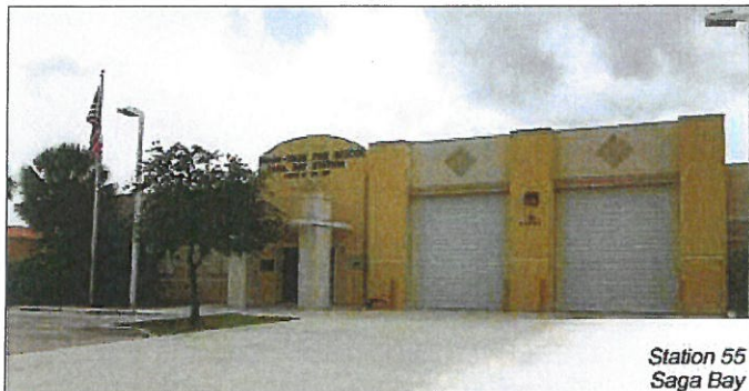
Station 55 Saga Bay

As a result, within three (3) miles of the Town of Cutler Bay, MDRF has 15 front-line response units, 13 of which are ALS units including six (6) rescues, seven (7) suppression units and two (2) Battalion Chiefs. Daily there are 48 firefighters on duty, 30 which are certified paramedics assigned to these units.