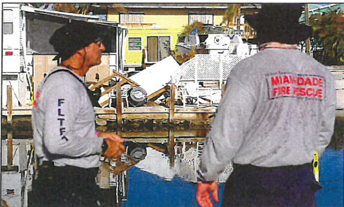
MDFR Urban Search & Rescue Team in the Florida Keys.

On August 27, 2017, 47 members of MDFR's Urban Search and Rescue Task Force were activated by FEMA and deployed to Texas to assist with search and rescue efforts in the aftermath of Hurricane Harvey. The team is comprised of specially trained firefighter/paramedics, physicians, engineers, search canines, and swift water rescue personnel capable of providing search and rescue in collapsed structures and flood/swift water environments. During the 2017 hurricane season, MDFR's FL-TF1 Urban Search and Rescue Team remained busy not only responding to Hurricane Harvey but also responding to Hurricane Irma, which impacted the Florida Keys, and Hurricane Maria, which devastated the Island of Puerto Rico a month later in September.