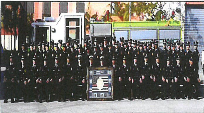
MDR Recruit Class #130

During 2017, MDR graduated four fire recruit classes, welcoming 136 new firefighters to the department. Recruit classes #130, #131, #132, and #133 all graduated at ceremonies held at MDR's Training Facility in Doral, Florida. Class #131 was the first class of non-certified firefighters who became State of Florida certified firefighters taught by MDR instructors at a MDR Training Facility since 1980.