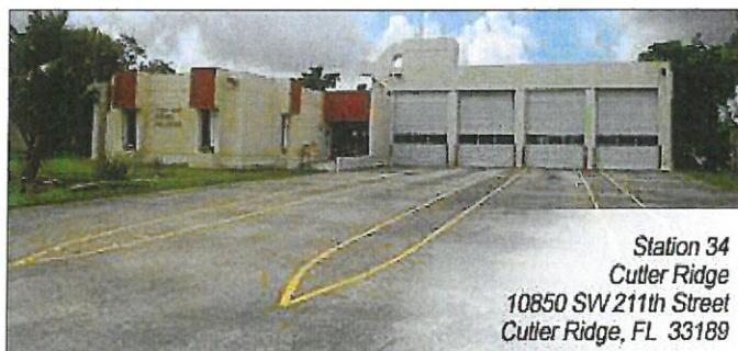
Station 34 Cutler Ridge 10850 SW 211th Street Cutler Ridge, FL 33189 Cutler Ridge Station 34 serving the Town of Cutler Bay

MDRF's closest Rescue units are housed within the Town of Cutler Bay at MDRF Cutler Ridge Station 34. MDRF's next closest medical response unit is located within the Town at MDRF Saga Bay Station 55, which houses one ALS Engine.