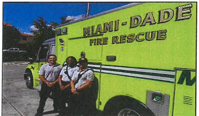
MDR's North Miami Central Rescue 18

MDR placed Rescue 18 in service in April 2017. This new response unit, consisting of an officer and two firefighter paramedics, augmented MDR's service to the visitors and residents of the City of North Miami. Rescue 18 currently operates out of North Miami West Fire Station 19 during the day and is housed at Interama Station 22 overnight. A temporary facility to house the unit and personnel 24/7 will be operational before the end of Fiscal Year 2017-2018, until the construction of a permanent station is completed by the end of 2020.